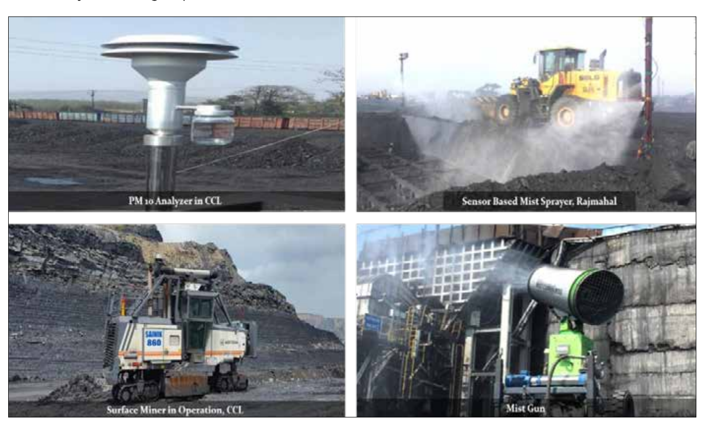
Fig. Dust Suppression measures adopted in various Coal/Lignite PSUs

The ambient air quality in and around coal mines is routinely monitored as per statutory stipulations and their results are shared with regulatory agencies. Continuous Ambient Air Quality Monitoring Systems (CAAQMS) have also been installed in opencast mines which are connected to SPCB websites for real time monitoring of Ambient Air Quality Parameters. Additional pollution control measures are undertaken, if required, to bring the air quality level within permissible limits.