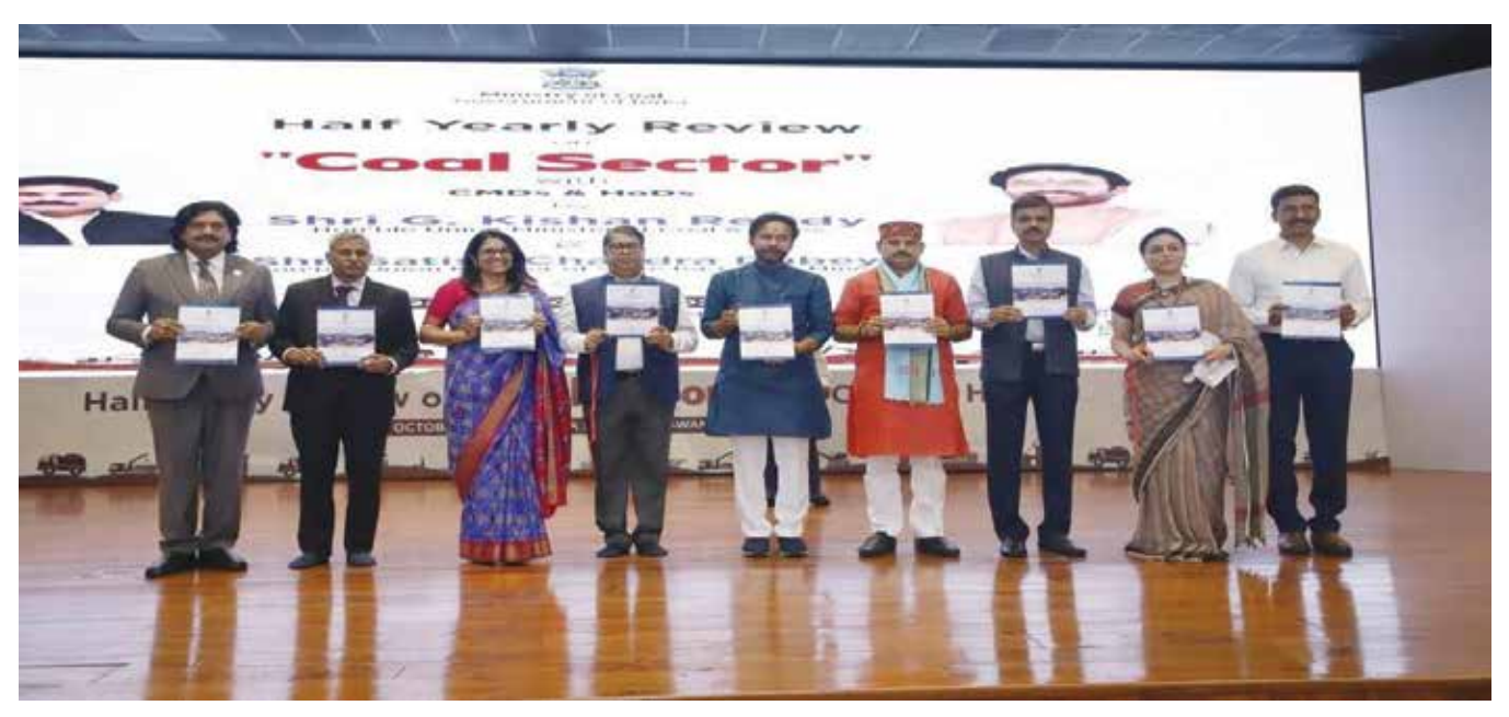
Release of HPEC Report by Hon'ble Minister of Coal & Mines

Key highlights of the report include strategies for processing OB to produce Manufactured- Sand (M-Sand), which can be used in construction projects, reducing the dependency on river sand and preventing environmental degradation. The commercial sale of this M-sand is expected to generate significant revenue for coal companies, and support local economies.