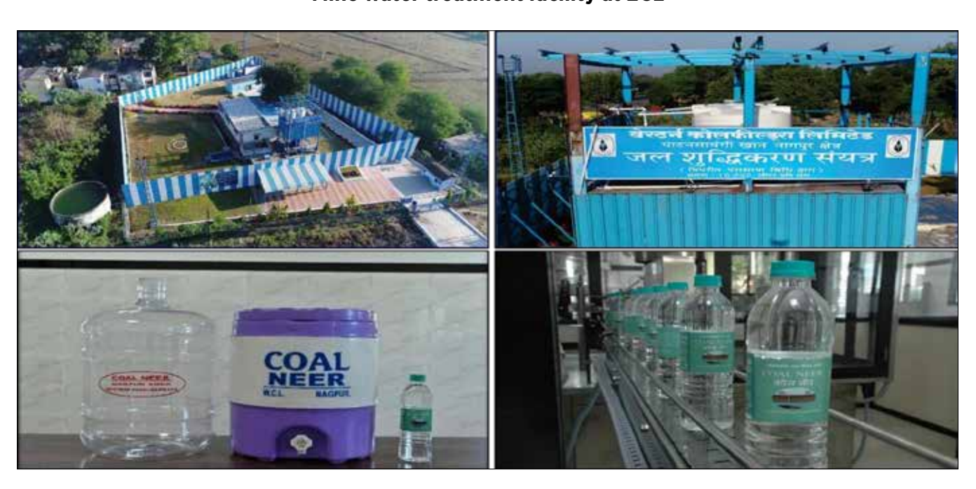
WCL's Coal NEER Project