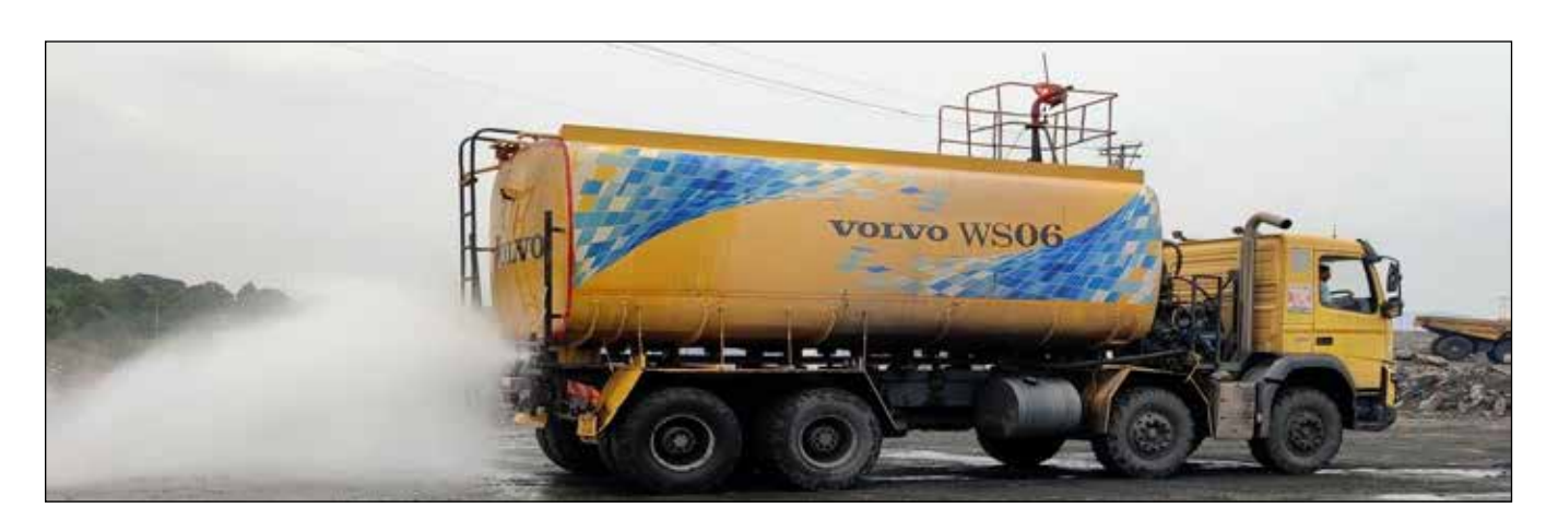
Mobile water sprinkler tankers at Bhubaneswari OCP, MCL

The trucks are being covered with tarpaulin and mist spray systems have been installed. For the purpose of controlling air pollution, fog cannons, wheel washing systems, motorised road sweepers, etc. are being used. It is encouraged to dispatch coal using the rail, MGR, conveyor, and tube conveyor networks.