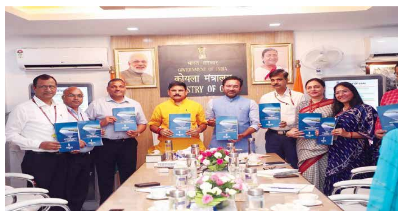
Release of Guidelines for Rejuvenation of Traditional Water Bodies in Coal and Lignite Mining Regions by Hon'ble Minister of Coal & Mines

including Coal India Limited (CIL) and NLC India Limited (NLCIL). The project aims to rejuvenate and establish at least 500 water bodies in and around coal and lignite mining areas over the next five years (FY 2024-25 to FY 2028-29). CPSUs will manage water bodies within leasehold areas, while District Collectors will handle the water bodies outside the leasehold area. Each new water body will have a pondage area of at least 0.4 hectares and a capacity of around 10,000 cubic meters. Additionally, the project will leverage mine water from active and abandoned mines, aligning with the Government of India's Jal Shakti Abhiyan.