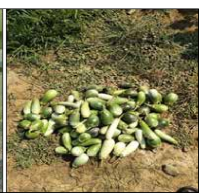
Community Organic Farming on Internal Backfilled Area - Bhubaneswari OC, MCL