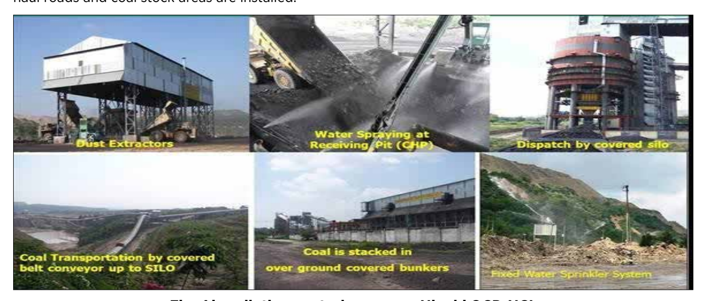
Fig. Air pollution control measures Nigahi OCP, NCL

Dust suppression systems are installed at loading, transfer and unloading points in mines. Additionally, water-spraying systems for arresting fugitive dust in washeries, CHPs, Feeder Breakers, Crushers, belt conveyors, haul roads and coal stock areas are installed.