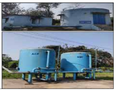
Fig. Sewage Treatment Plant (1.7 MLD), Lakhanpur OC, MCL