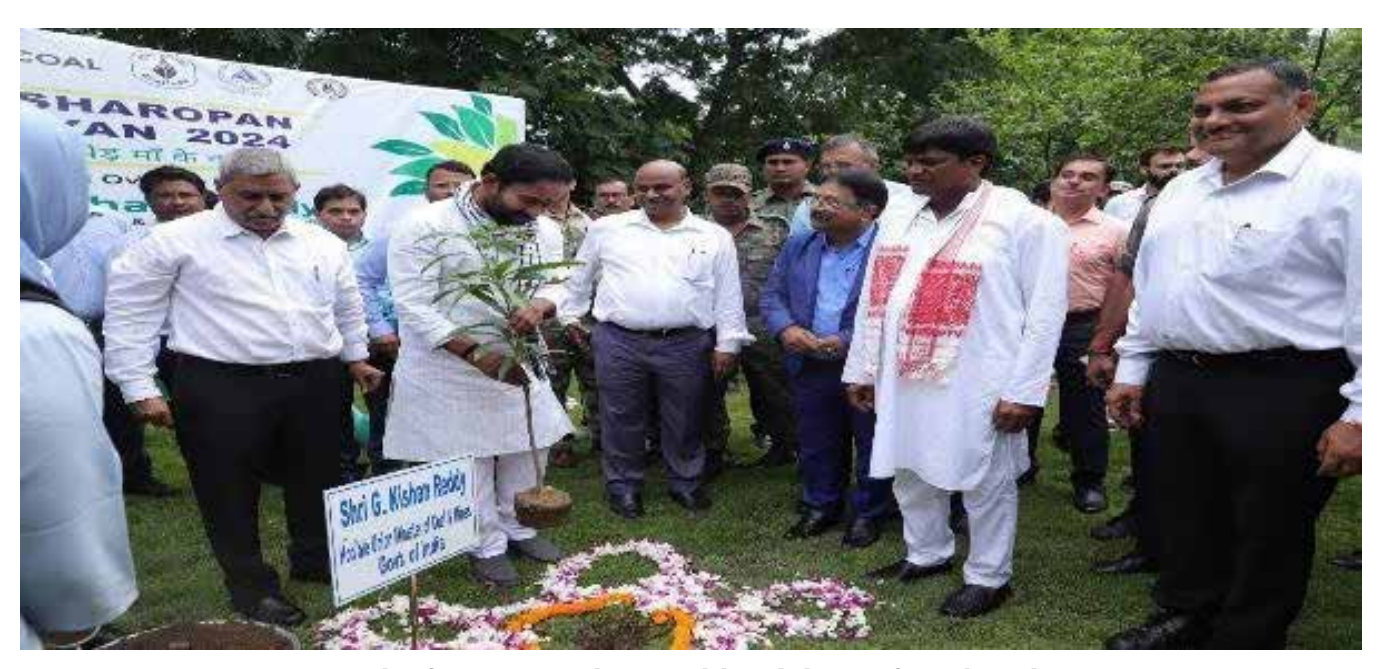
Launch of VA - 2024 by Hon'ble Minister of Coal & Mines