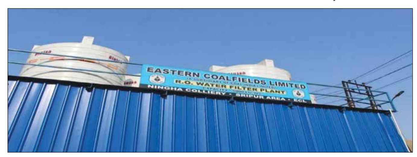
Mine water treatment facility at ECL

Apart from MoU's, subsidiaries of CIL, for beneficial use of mine water by the nearby community, continuously endeavoured departmentally in planning, designing, implementation and execution of various schemes successfully.