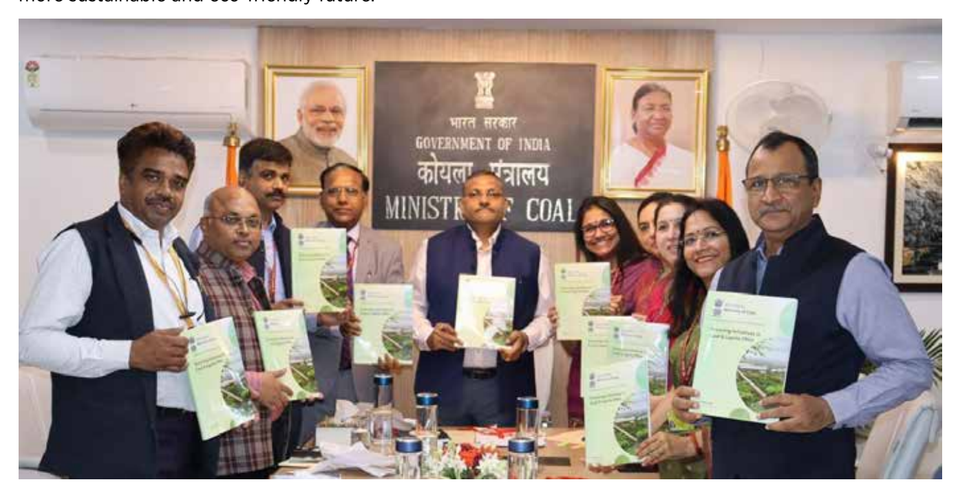
Launch of Report on Greening Initiative in Coal & Lignite PSUs

Coal Ministry has released a report titled "Greening Initiative in Coal & Lignite PSUs", which highlights the efforts of the PSUs in the coal and lignite sectors to restore and rejuvenate mined- out lands. This report emphasizes the consistent and earnest endeavours made by Coal/Lignite PSUs to mitigate the environmental impact of coal mining through ongoing reclamation and afforestation endeavours. The report presents greening initiatives carried out in both closed and active coal mines, alongside a blueprint for a more sustainable and eco-friendly future.