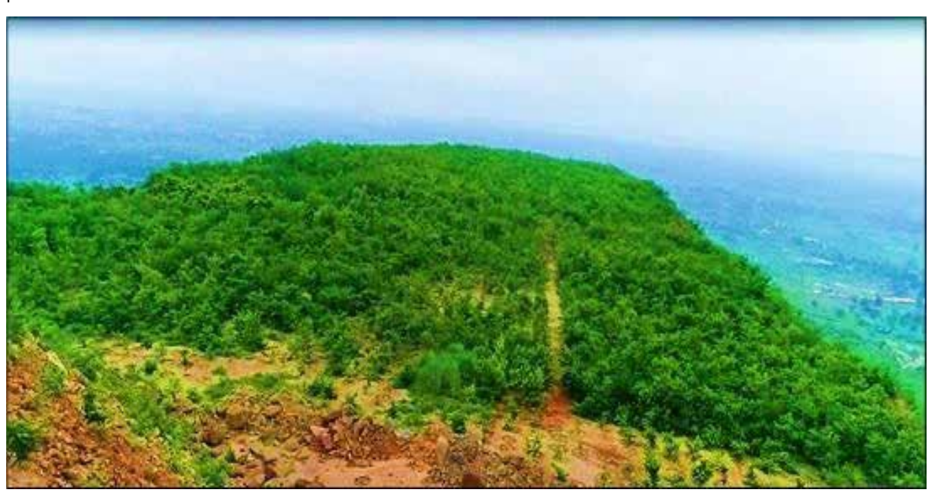
ACA on Backfilled Area of Amlohri OCP, Singrauli, MP

The plantation carried out on non-forest backfilled as well as external overburden dumps is best suitable for Accredited Compensatory Afforestation (ACA). The Ministry of Coal has guided Coal/Lignite PSUs to extensively cover non-forest land for compensatory afforestation in future to promote ACA and expedite the Forest Clearance process. As per the Vision Viksit Bharat, Coal/Lignite PSUs are committed to create an ACA Land Bank of 9200 Ha during FY 2024-25 to FY 2028-29.