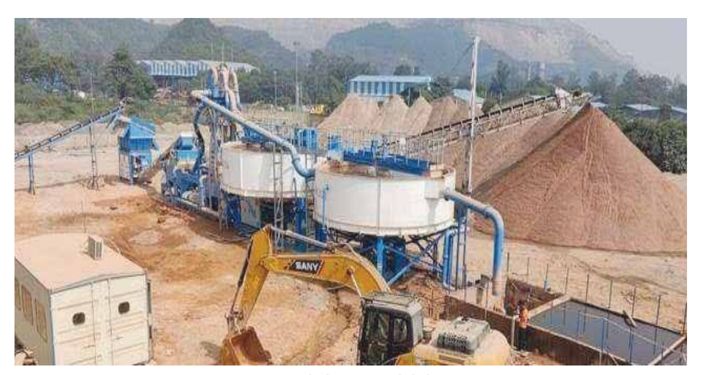
OB to Sand Plant at Amlohri, NCL