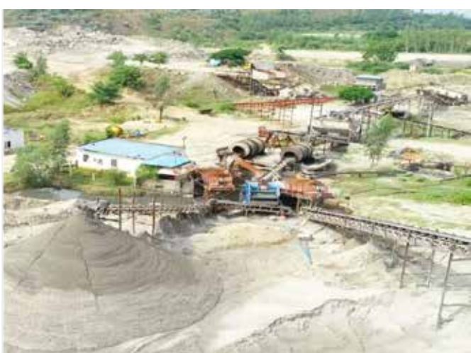
Processed Overburden Plant at Gonegaom Area by WCL & at Srirampur OC Mines by SCCL