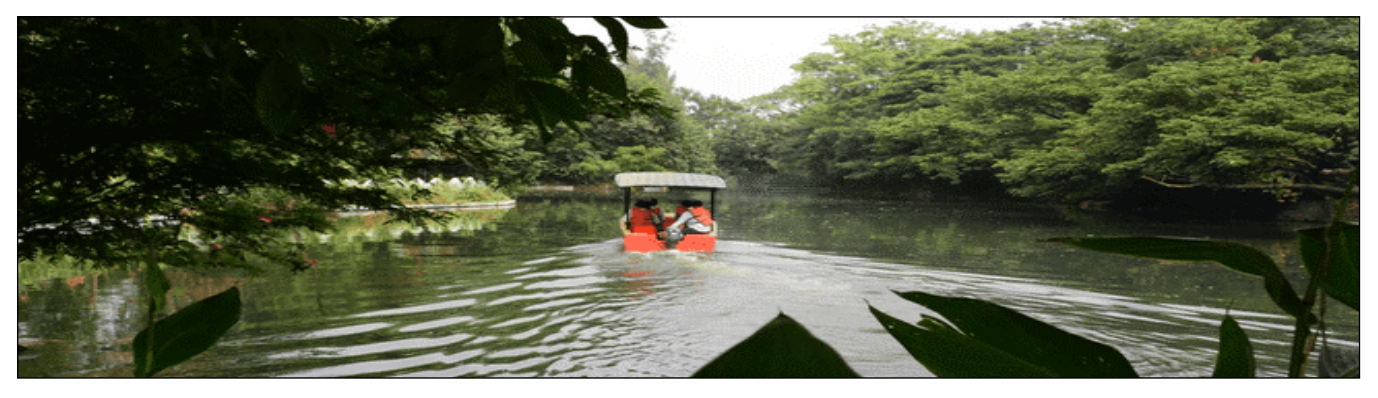
Boating in Artificial Lake area