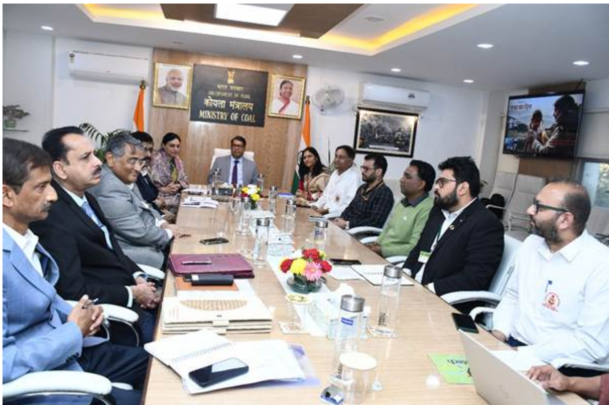
Nanha Sa Dil is a unique CSR initiative by CIL in collaboration with SSSHET, leveraging the trust's expertise in paediatric cardiac surgeries. Under this initiative, CCL will screen 45,000 children in Jharkhand, with surgeries planned for 500 children diagnosed with CHD and NCL will conduct 345 grassroots-level screening camps for 17,250 children, referring those in need to a dedicated diagnostic centre at NCL Bina Hospital for Echo analysis and further treatment.