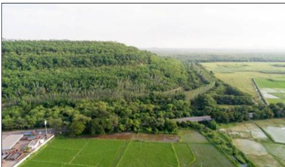
Green cover on reclaimed OB dump of JVR OC-II of SCCL

Vriksharopan Abhiyan 2021 , which is one of the key events of Azadi Ka Amrit Mahotsav celebrations in the coal sector, will surely bring environment sustainability in mining operations and help coal sector obtain social and environmental licence to operate, which will be very crucial in coming days when more mines will be opened up involving new players. Also, the Abhiyan is expected to sensitize and motivate the society and common people to take up more and more afforestation initiatives in their neighbouring areas.