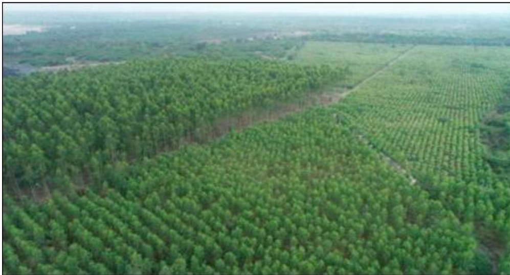
Plantation on Vacant areas in Ramagundam OC of S