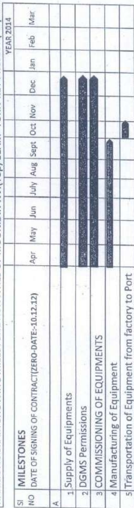
HARMONOGRAM SHOWING MILESTONE ACTIVITIES OF MOONIDIH-XVI(Top) SEAM -TURN-KEY PROJECT (As provided by the Bidder)