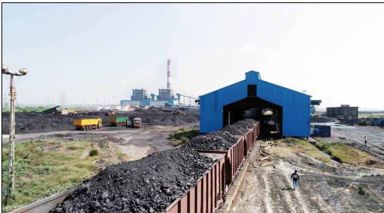
Uninterrupted Coal supply to power plants