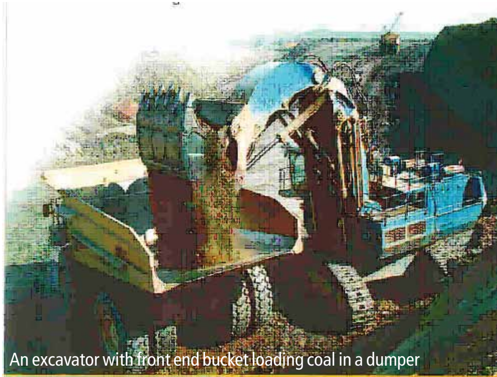
An excavator with front end bucket loading coal in a dumper